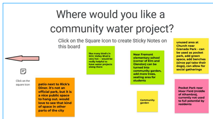
Above: screenshot of workshop jam board